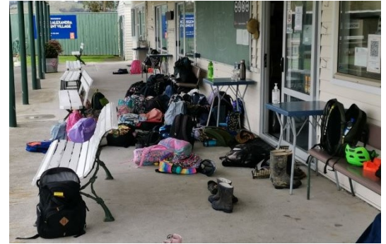
Bay View bowling club amenities is being used everyday as a classroom